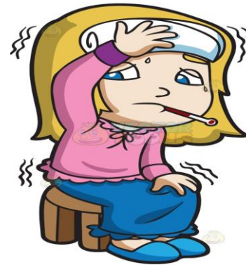
Feeling unwell / ↑ Temp