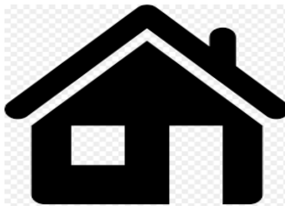
At your home