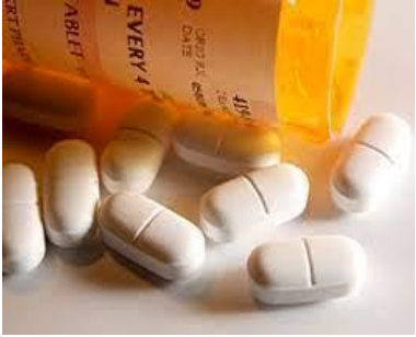
Missed or late medication