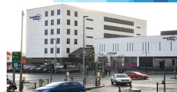
At your college /school