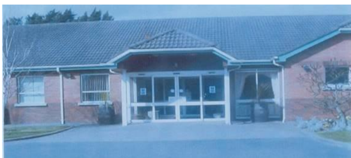
At your day centre