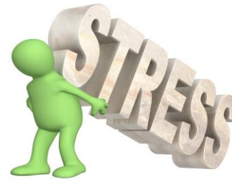
Stress or distress