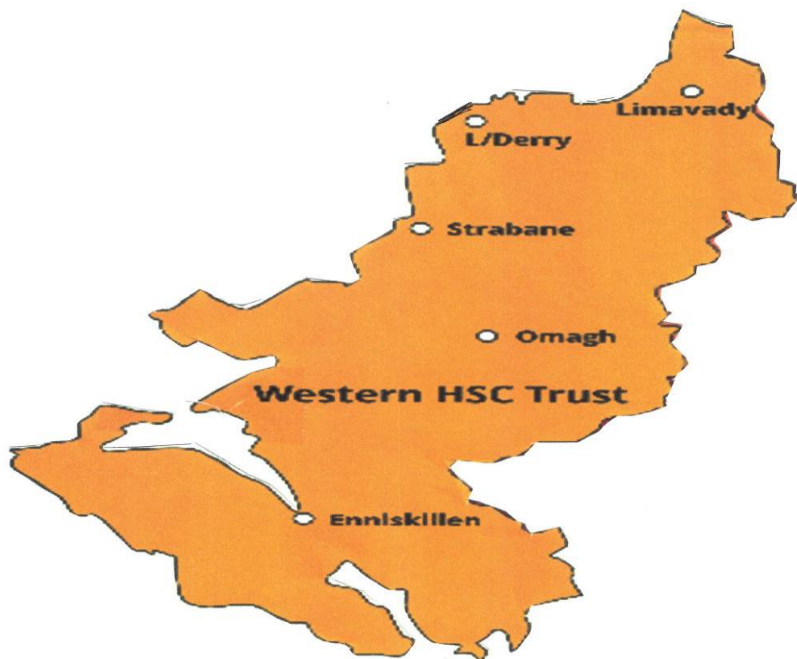
Entire Western Trust Remit