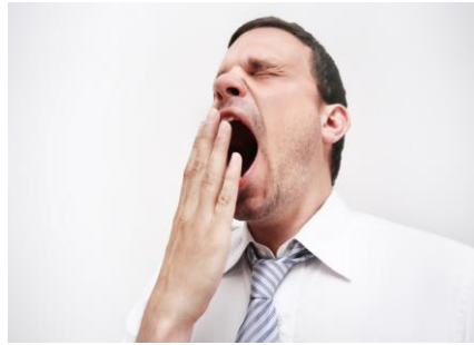
Feeling tired or sleepy