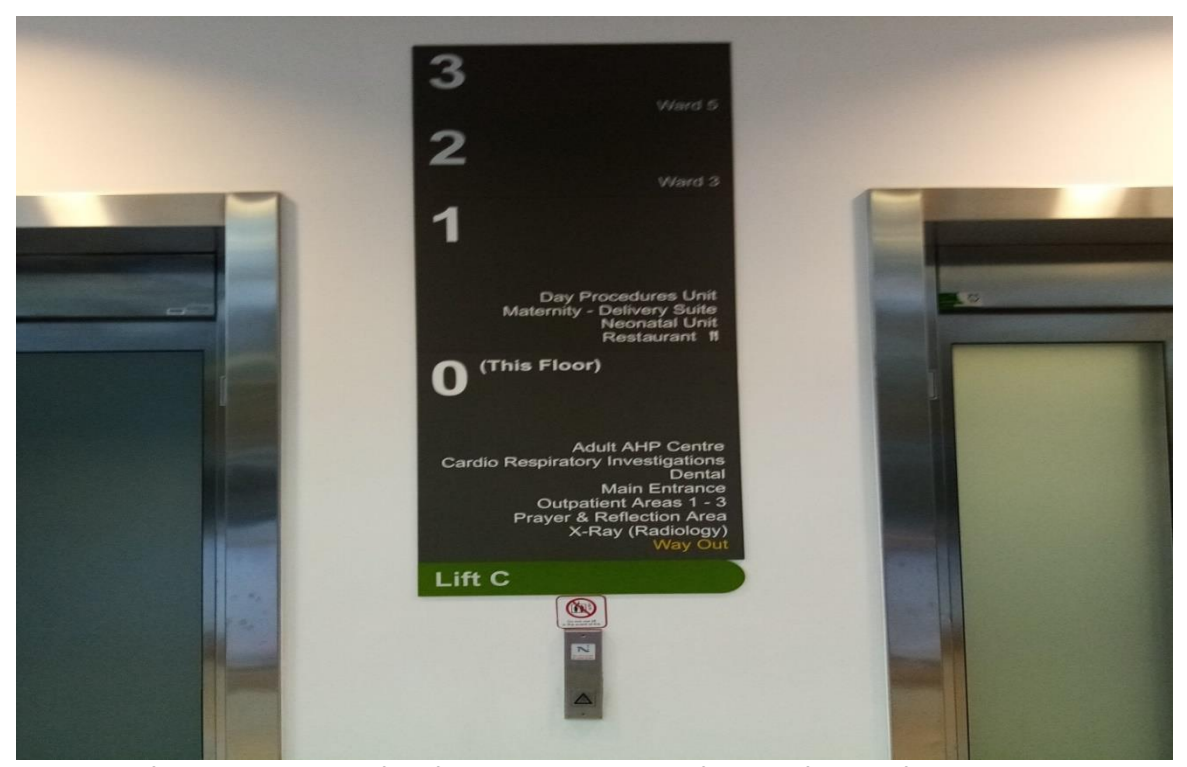
Enter the lift and select 1- the first floor. On exiting the lift turn left and left again onto the main corridor.