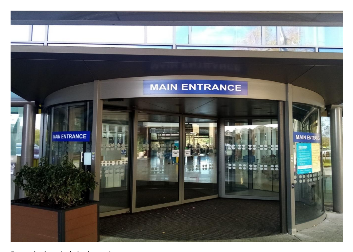
Enter the hospital via the main entrance