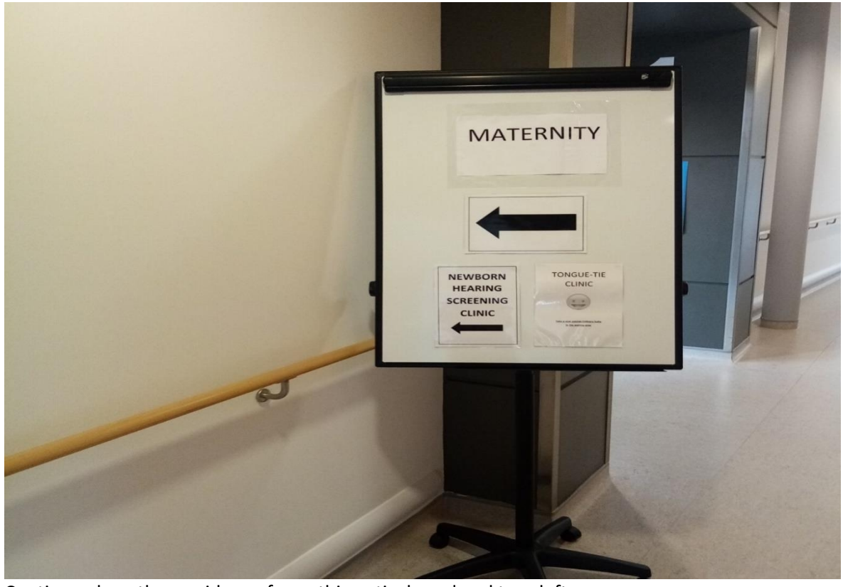
Continue along the corridor as far as this noticeboard and turn left.