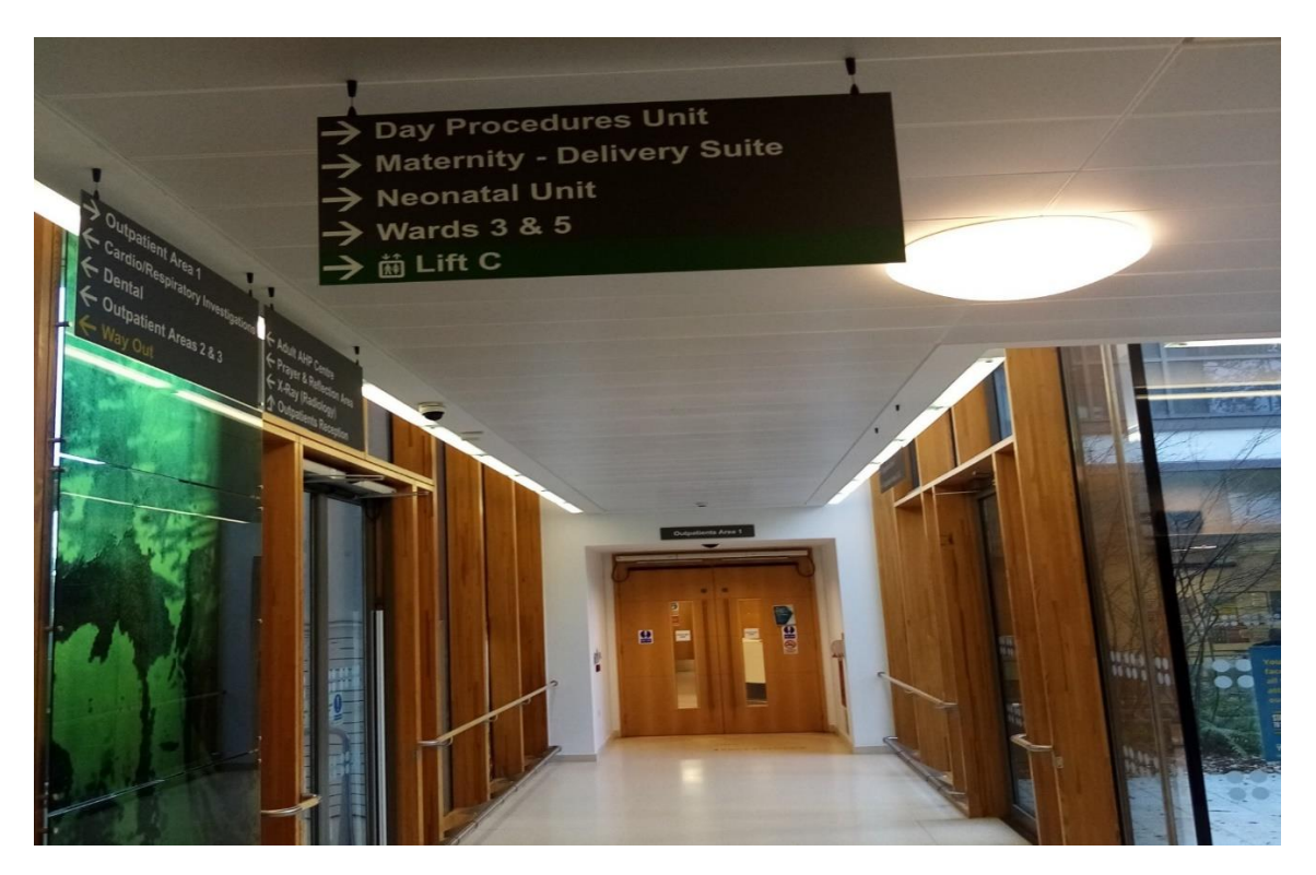
As you pass through the double doors the next right will bring you to Lift C

Once you pass through the double doors take the next corridor on the left following the sign for Maternity- Delivery Suite Lift C.