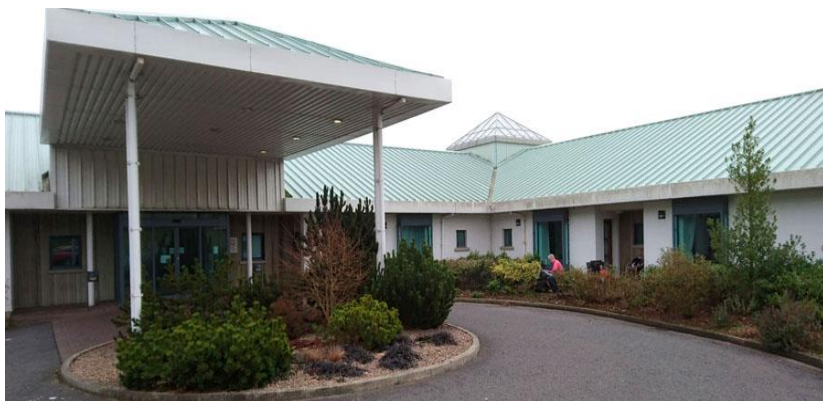
At your day centre