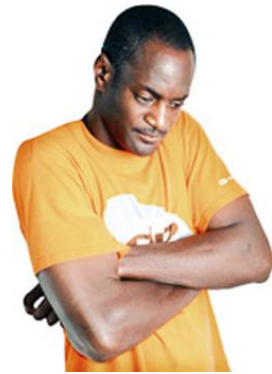
We can't talk