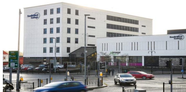
At your college