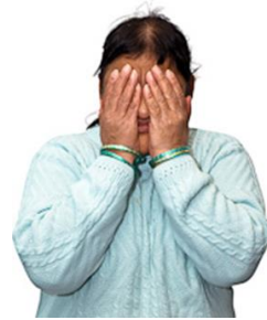
We are shy