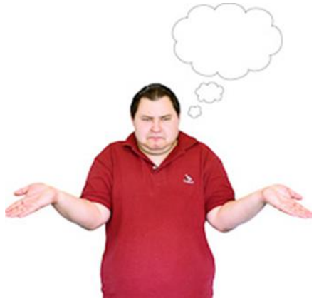
We don't understand