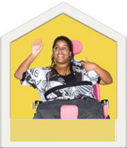
At your home