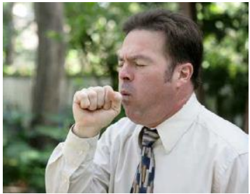
Cough or choke