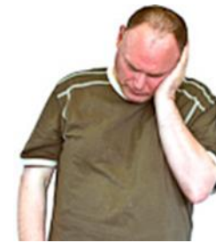
We cannot hear or see