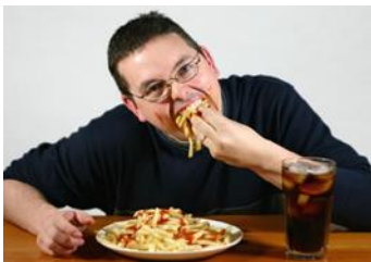
Put too much food in our mouths