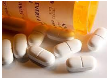
Tablets hard to swallow