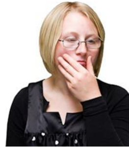
Have problems chewing