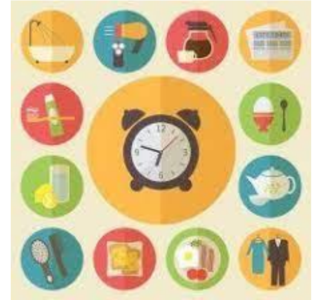
Activities, routines & hobbies

Things that are important to you are important to Occupational Therapy – OUR aim is to ENABLE YOU