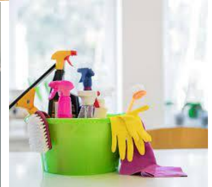
Learning new skills