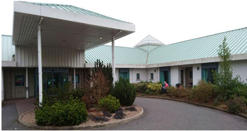
At your day centre