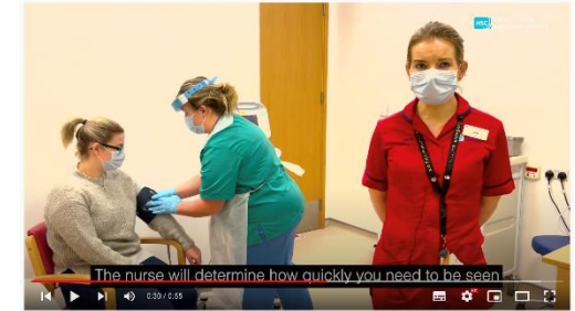
Emergency Department, South West Acute Hospital | What is Triage?