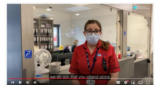
Emergency Department, Altrngelvin Hospital | What is Triage?