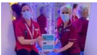
NI's first LD Sensory Room Opened at Altnagelvin Emergency Department