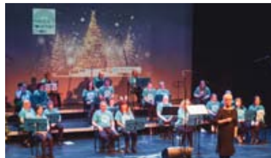
Friends Together Choir