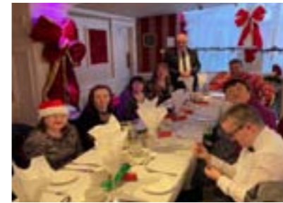
Excited for the Christmas meal!

The Valley and Oaktree Day Centre clients and staff had their Christmas Ball in the Belfray Country Inn on Tuesday 21st December 2021, everyone enjoyed the meal and dancing.