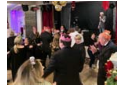
Enjoying some dancing!