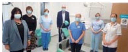
Crannog Dental Centre Official Opening