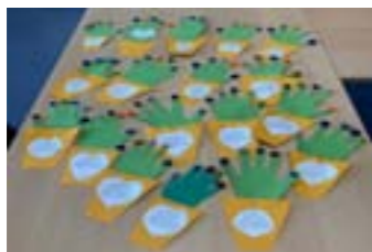
Service Users made some handprints for Mother's Day.