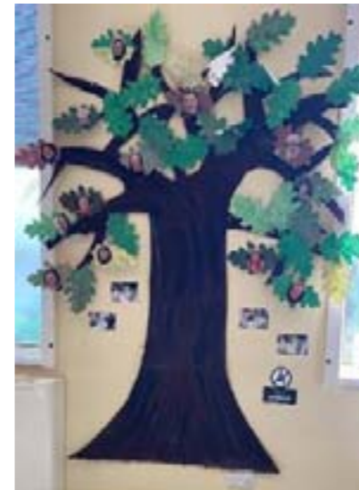
Service Users made this tree out of card and added their photos to the leaves.

It has been a busy few months at Oaktree Day Centre.