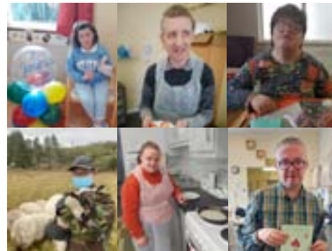
Day Centre Updates