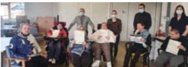
Maybrook Service Users complete recycling programme