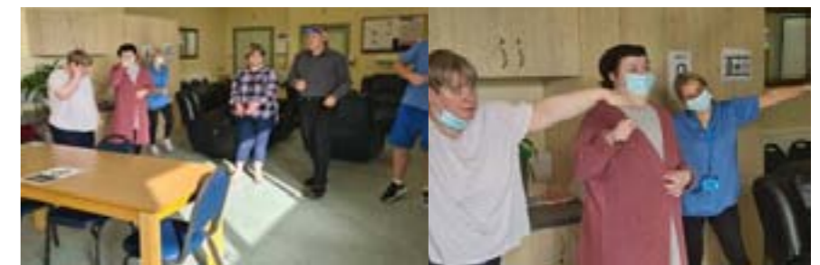
Service Users and staff have enjoyed doing their keep fit classes in the morning.