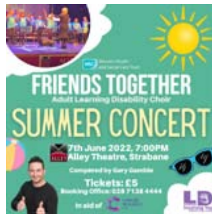
Friends Together Choir

Welcome to the Spring 2022 edition of our Adult Learning Disability Services Newsletter. In this special edition we highlight some events our service users have taken part in over the past few months.